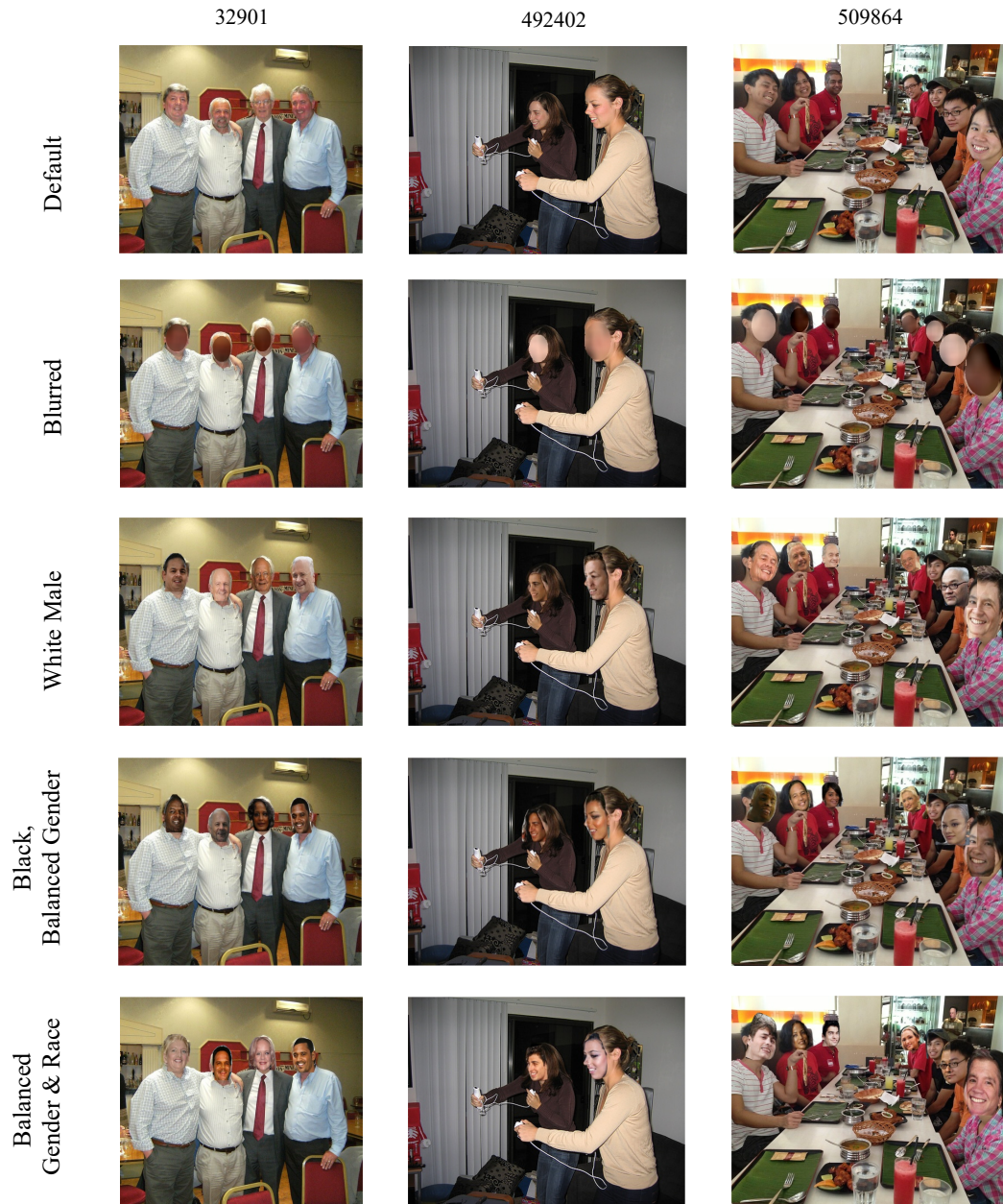
Figure A.1: A selection of example images used for training. They are labelled by their COCO IDs, such as "32901", as well as the dataset they belong to. Details about the creation of each dataset can be found in 3.