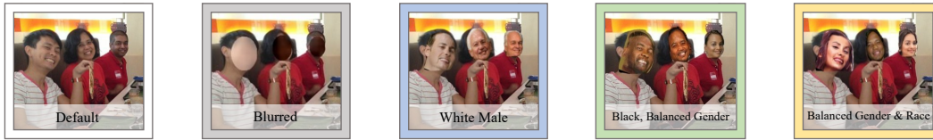
Figure 2: Example Images. Five versions of the same COCO image (ID=509864), each taken from one of our datasets. Default is the original, Blurred was created by blurring detected faces, and White Male , Black, Balanced Gender , and Balanced Gender & Race are created using the GAN-based method, augmentations outlined in Section 3.